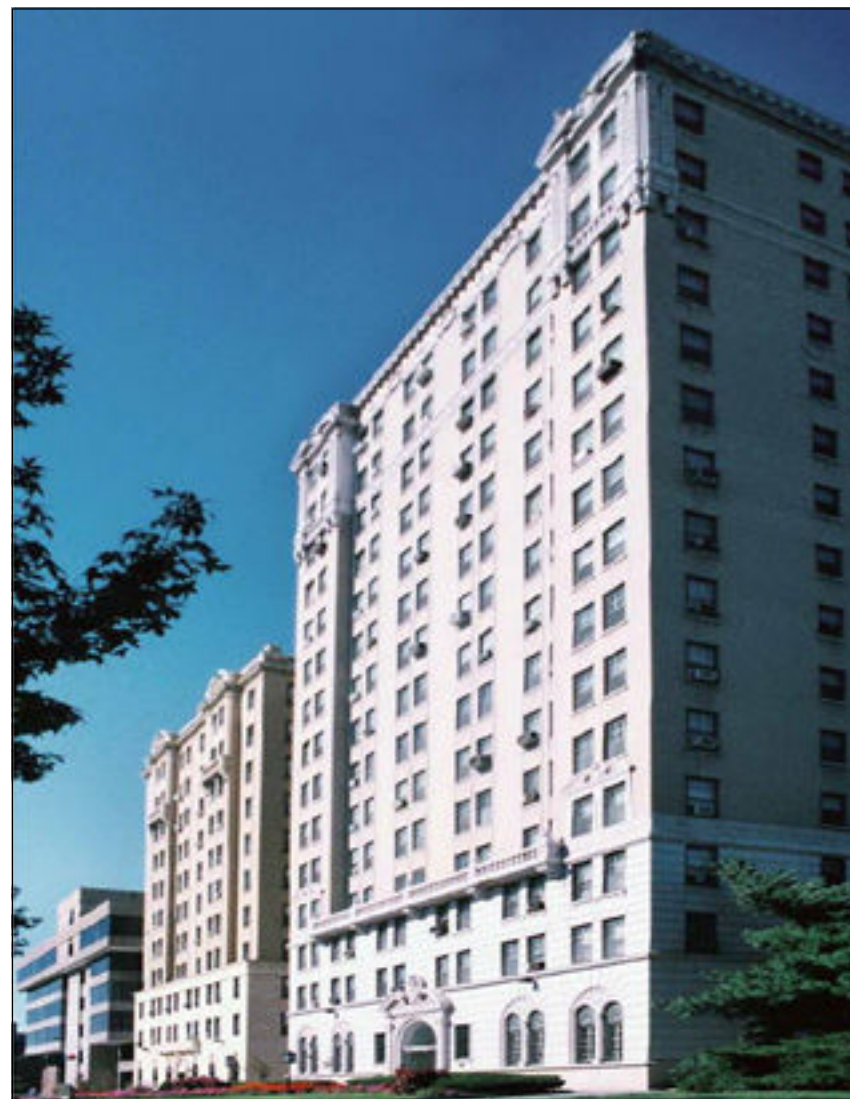
The President Apartments and Park Royal Apartments. Bianco acquired these classic St. Louis apartment towers in 1973 and 1995.

We have worked hard to build a reputation in the real estate community as knowledgeable investors who perform promptly and buy quality properties.